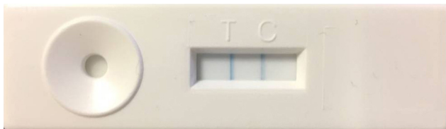
Figure 1 Example of a positive salivary pepsin test.